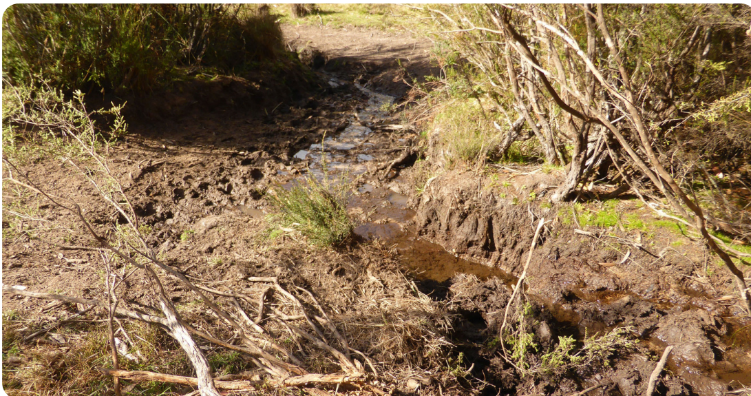
Bill Jones Hut water source