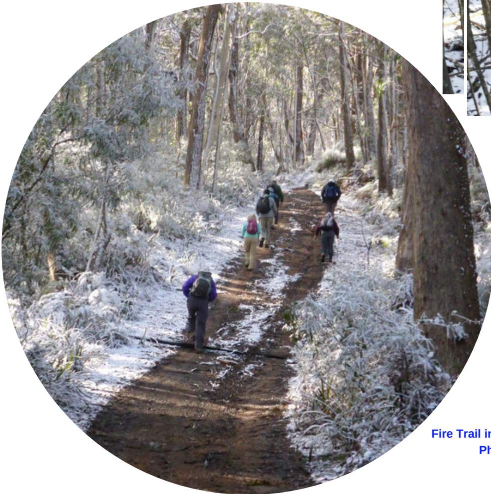
Fire Trail in Tallaganda National Park