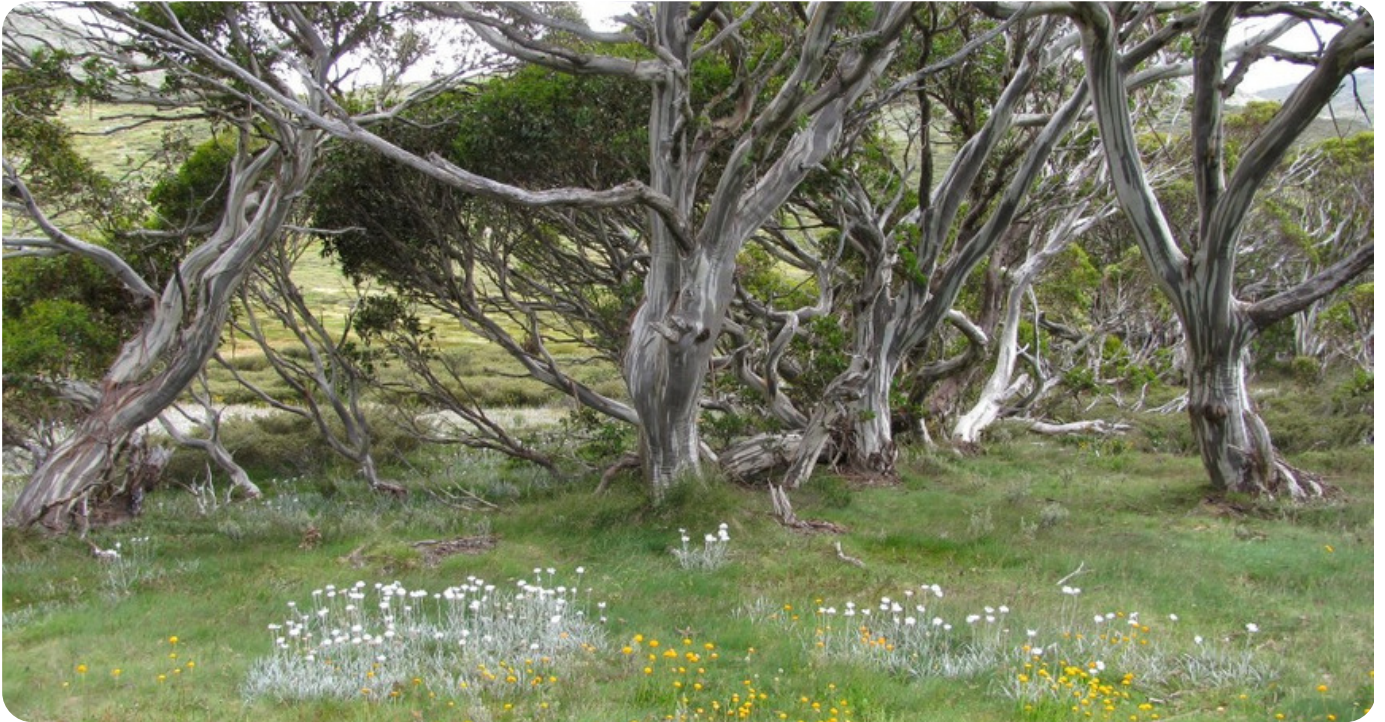
Untrampled meadows at Pounds Creek