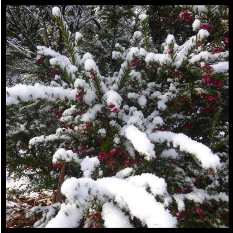
Grevillea in Tallaganda National Park

It's been a great season for snow in the local area