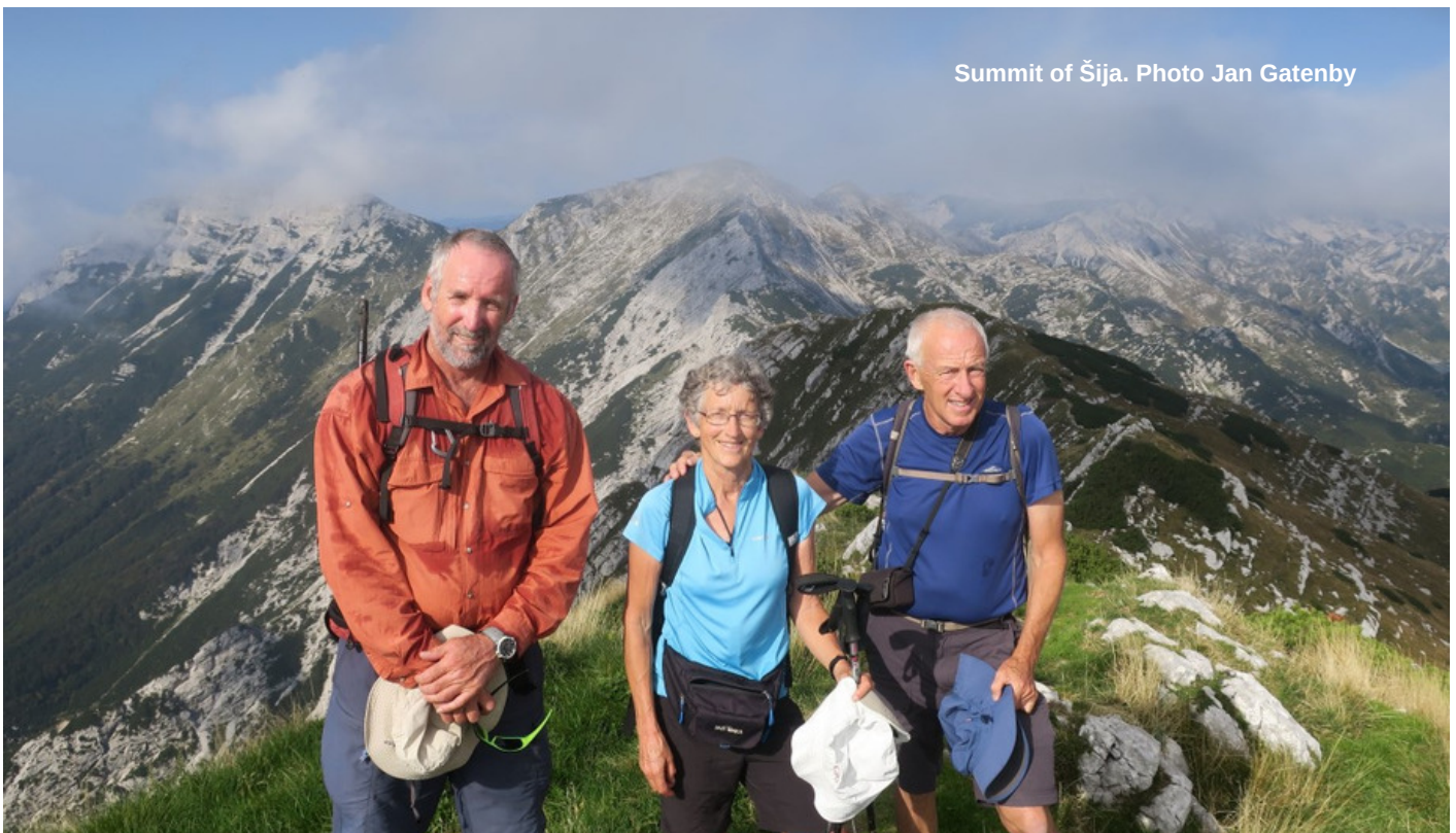
Summit of Šija.

The cable car soon cleared the usual morning fog and from Vogel station we had spectacular views over the top of the fog to Triglav and other mountains majestic in cloud and sunshine.