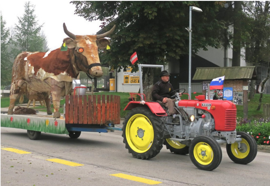
Off to the Cow ball.

Getting to the start required a bus, cable car and chairlift. As we waited in Ribčez Laz for the bus, a tractor with a trailer drove by. On the trailer was a giant cow replete with a pile of “manure” below her rear end and orange eyes the size of road reflectors (which they probably were) that glowed. Clearly off to Ukanc for the Cow Ball.