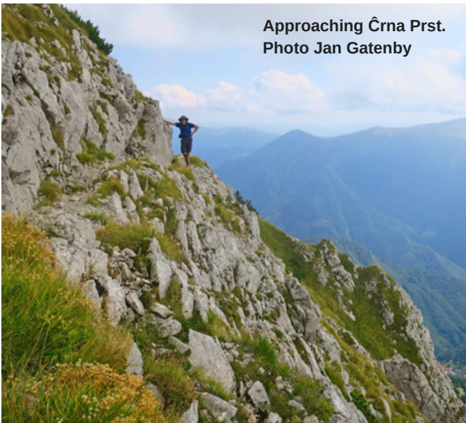
Approaching Črna Prst.