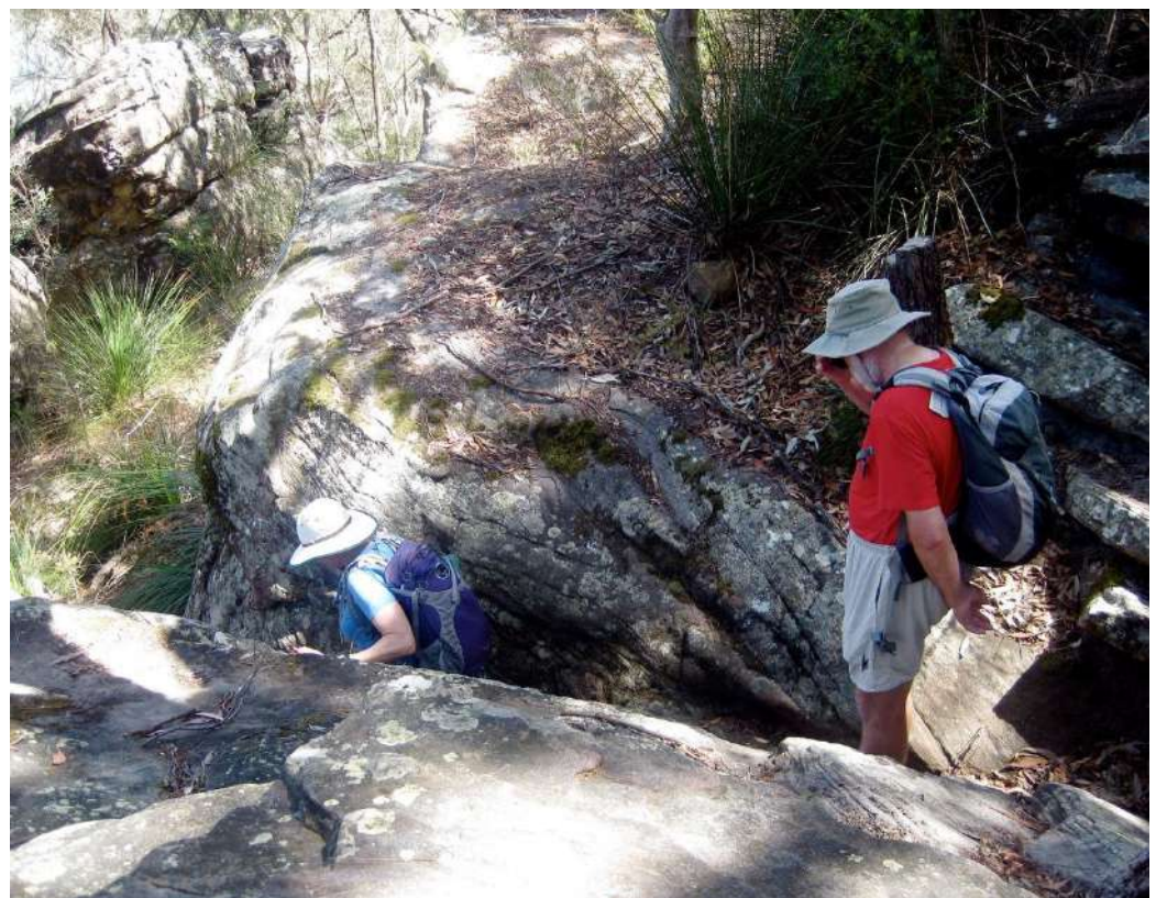
A section of the Umina to Patonga Walk

Wiseman's Ferry. In recent years the club has done a trip based in this area. One of the best walks is the Old Great North Road walk via Finch's Line on the north side of the Hawkesbury. It starts from a point on the road east of the cross-river ferry terminal and leads up following the route chosen for a road - and partly constructed - by the Government Surveyor Heneage Finch. At the top it joins the historic Old Great North Road which you follow down through lovely sandstone country with great views back to the ferry.