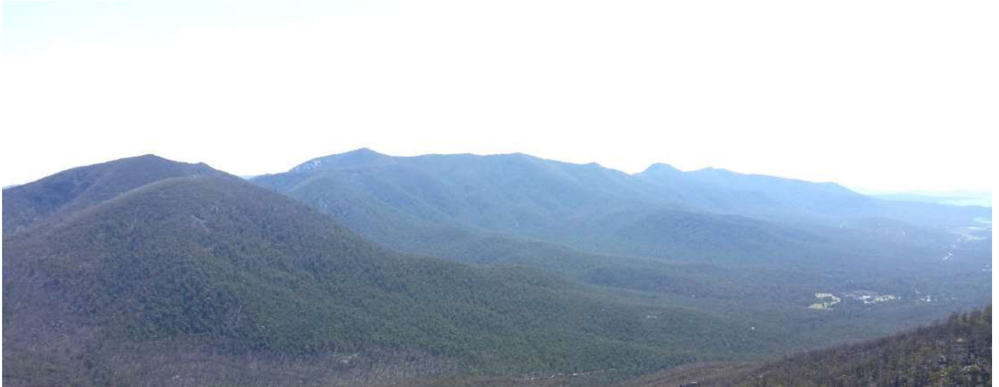
Looking towards Tidbinbilla Range from Billy Billy Rocks