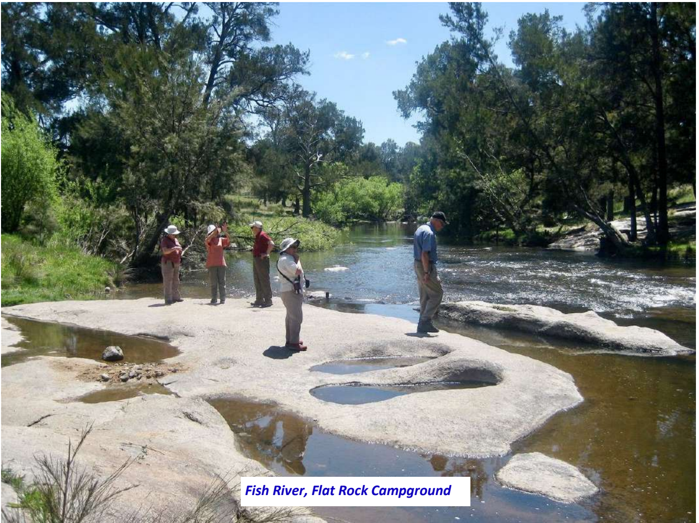
Fish River, Flat Rock Campground

Wiseman's Ferry. In recent years the club has done a trip based in this area. One of the best walks is the Old Great North Road walk via Finch's Line on the north side of the Hawkesbury. It starts from a point on the road east of the cross-river ferry terminal and leads up following the route chosen for a road - and partly constructed - by the Government Surveyor Heneage Finch. At the top it joins the historic Old Great North Road which you follow down through lovely sandstone country with great views back to the ferry.