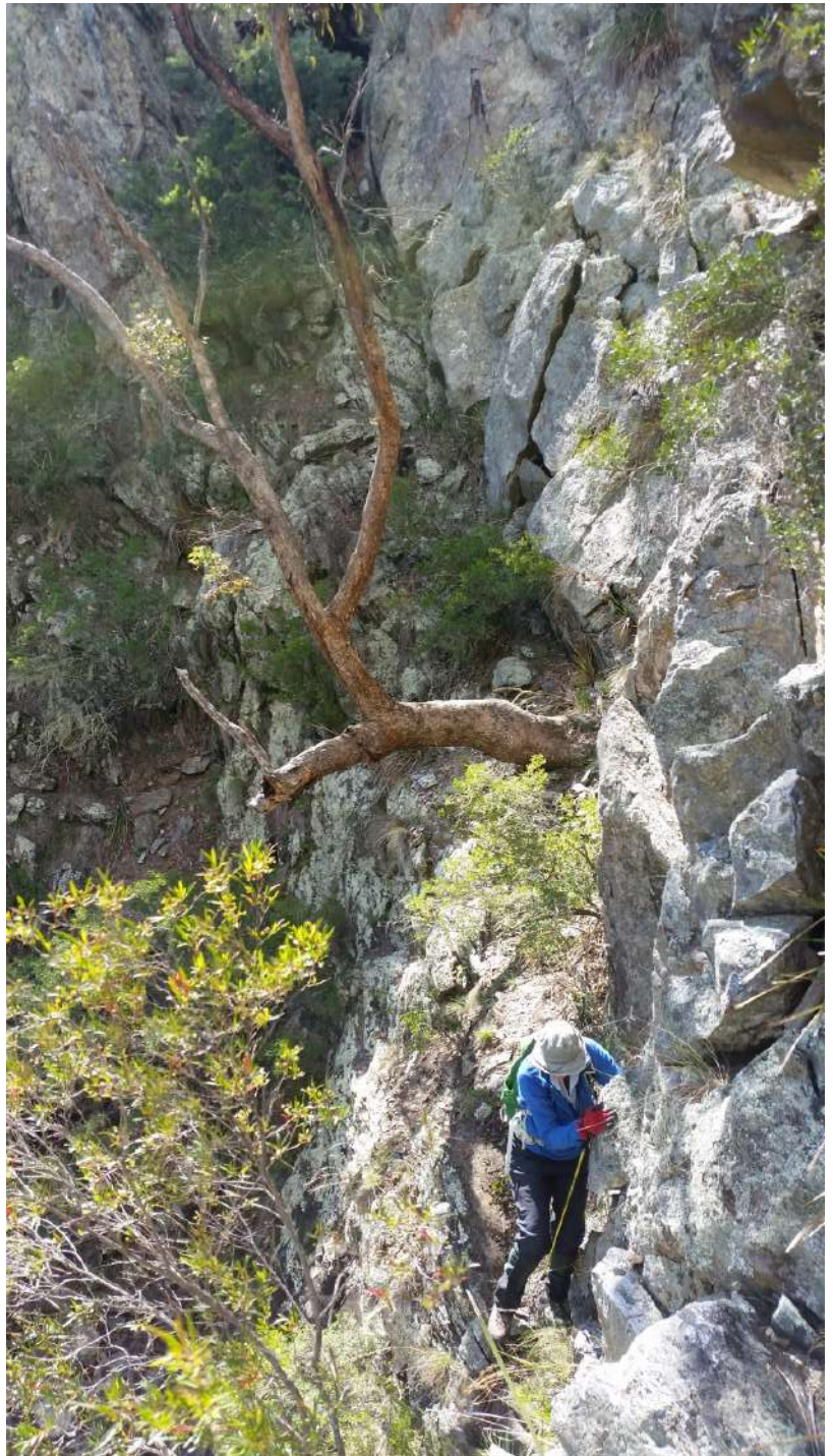
A testing climb on a recent walk