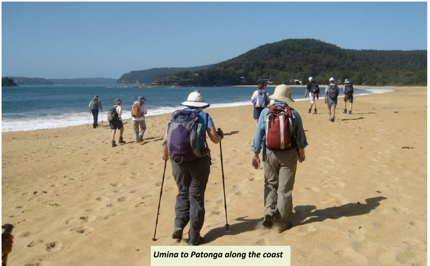
Umina to Patonga along the coast

Umina. The caravan park here is a very large NRMA-owned facility, and best avoided in school holidays and at weekends. It does, however, provide a good starting point for a delightful walk along the coast to Patonga (where you can have a fish and chip lunch). You walk through the small but very up-market Pearl Beach, then up through the national park with a wonderful array of vegetation, and great views from rocky ledges over the lower Hawkesbury River.