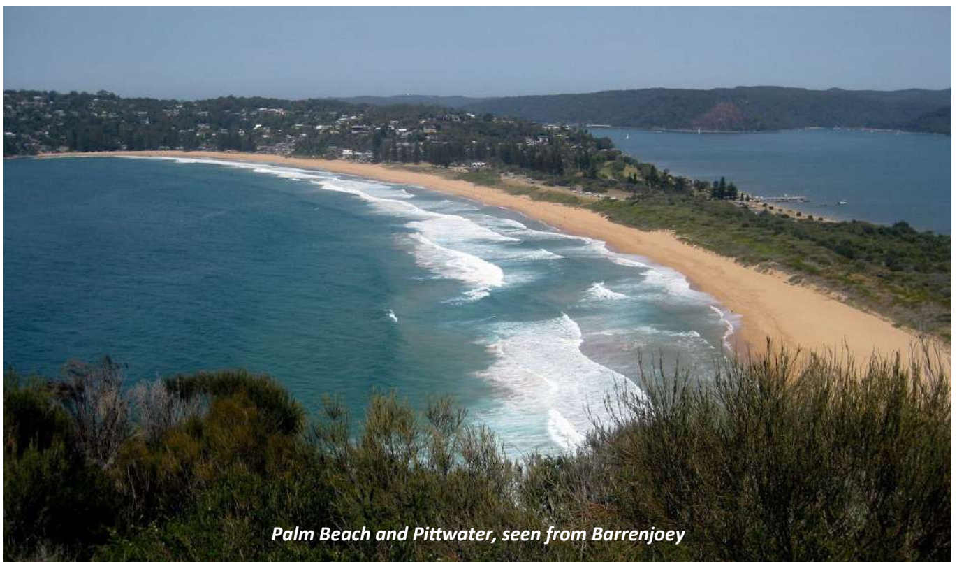
Palm Beach and Pittwater, seen from Barrenjoey

Umina. The caravan park here is a very large NRMA-owned facility, and best avoided in school holidays and at weekends. It does, however, provide a good starting point for a delightful walk along the coast to Patonga (where you can have a fish and chip lunch). You walk through the small but very up-market Pearl Beach, then up through the national park with a wonderful array of vegetation, and great views from rocky ledges over the lower Hawkesbury River.