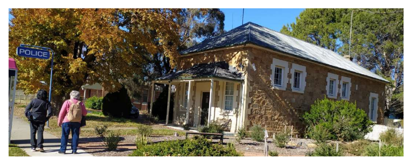
The Police Station was originally the old court house

What a marvellous day we had in Bungendore on Monday 31 May with a fabulous group of 24 club members (2 nonagenarians) and 1 visitor!!!