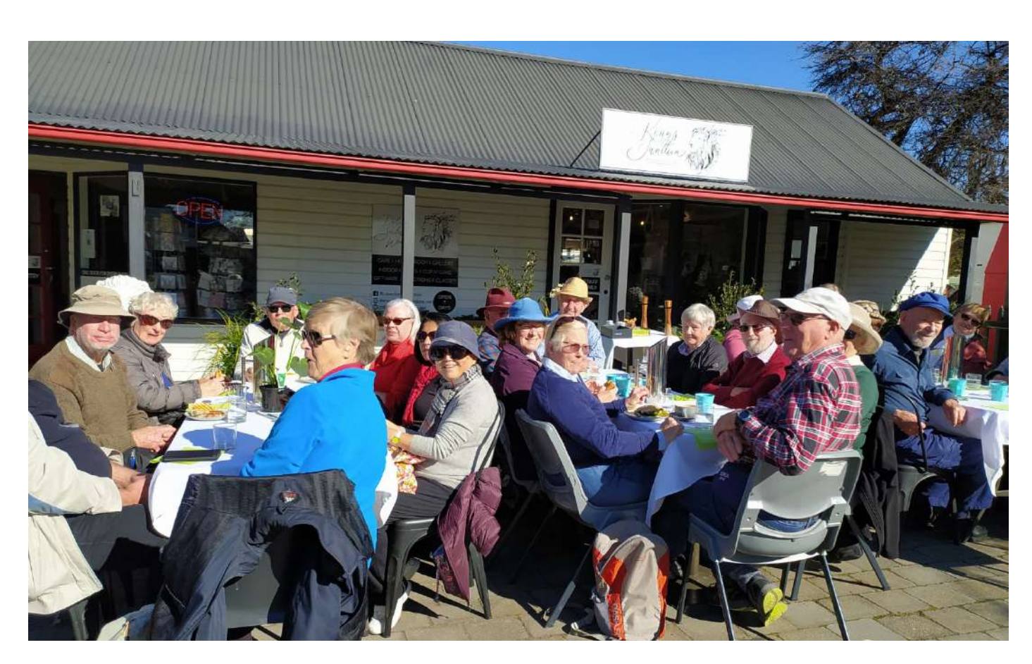
The group enjoying lunch in the Village Square