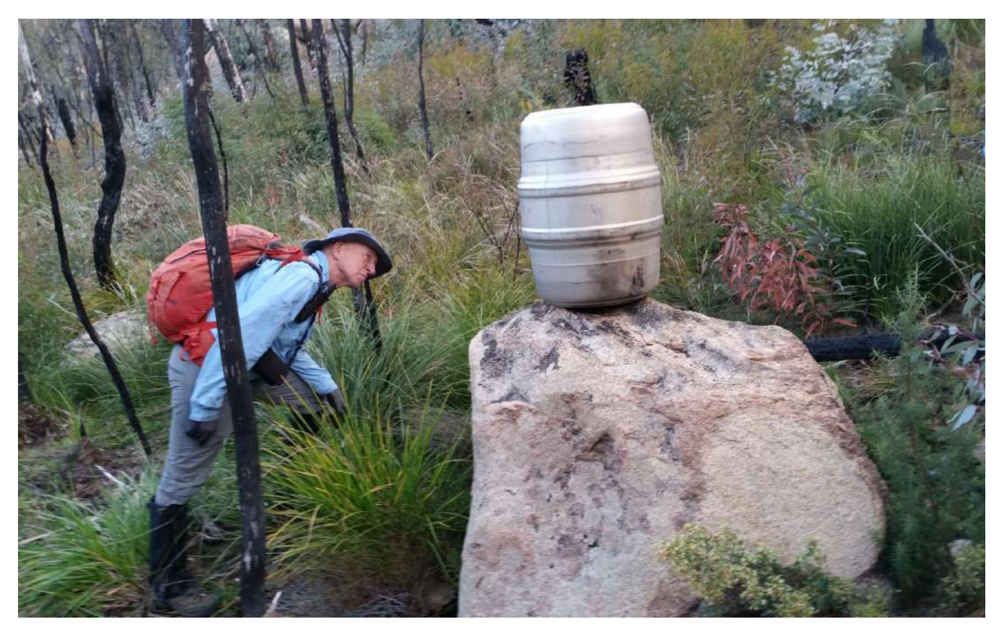
Found just above a creek in Namadgi. When full, this would have weighed over 60 kgs.