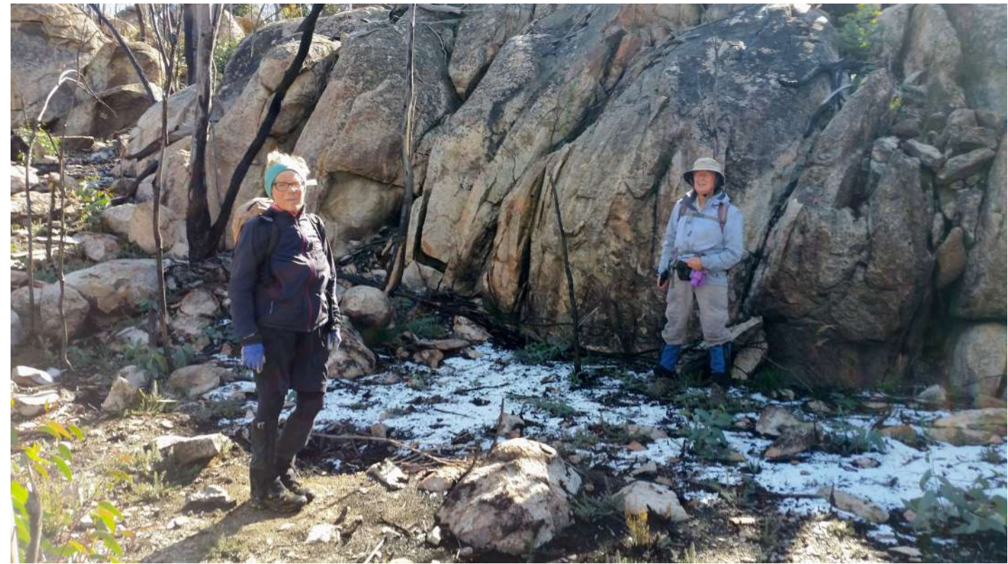
We had our first snowfall on 15 May