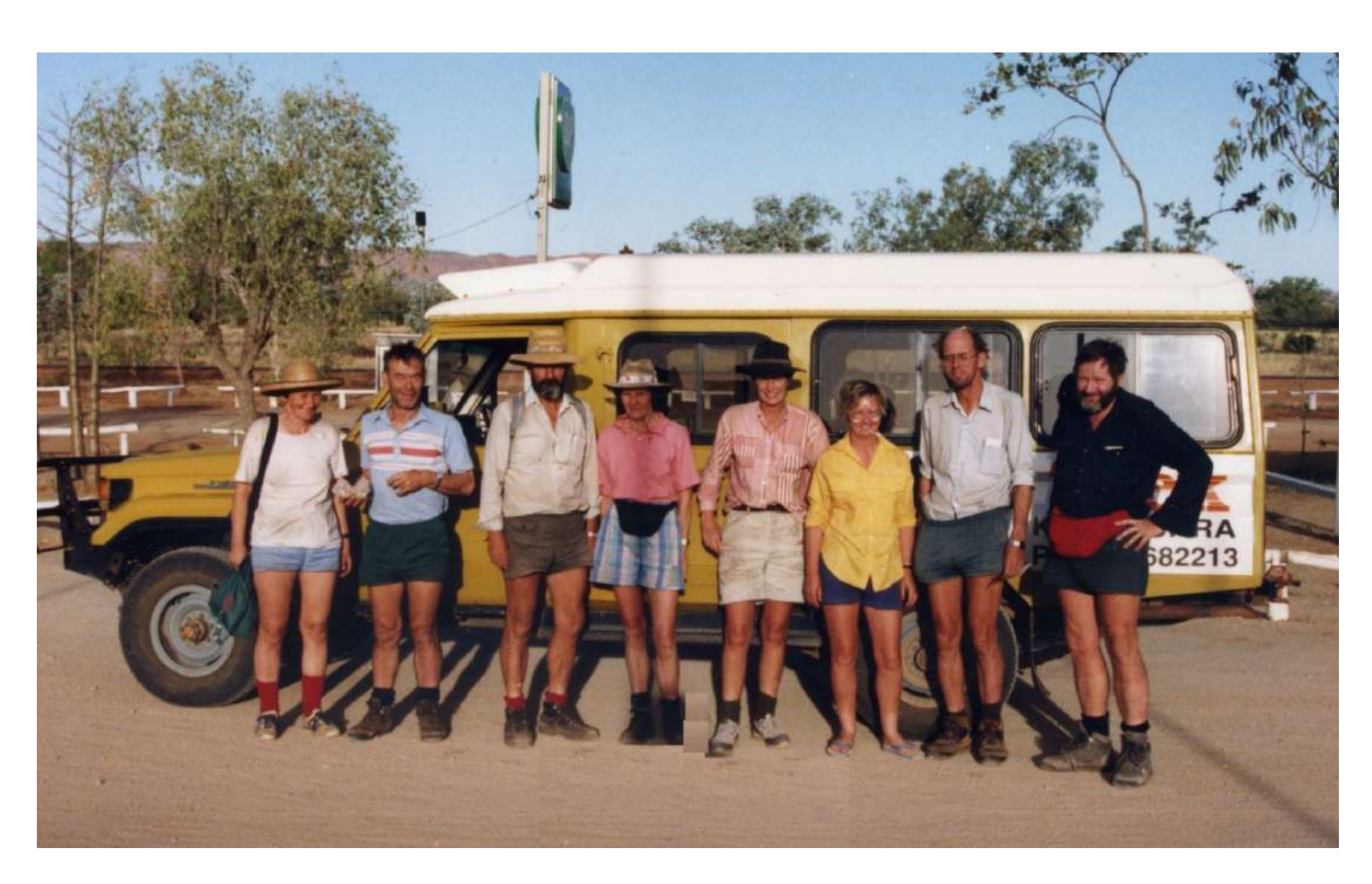
Recognise the people in this photo from the Bungle Bungles in June 1992? The names are at the bottom of the next page