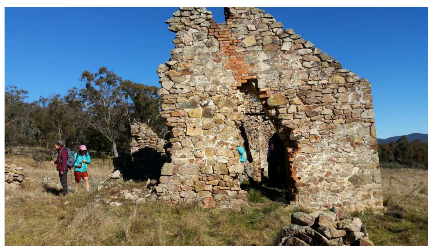
Peter Wellman led a weekend group to these substantial ruins near Cronin Forest (Rossi area). Note the unusual angled chimney — there is one at each end.