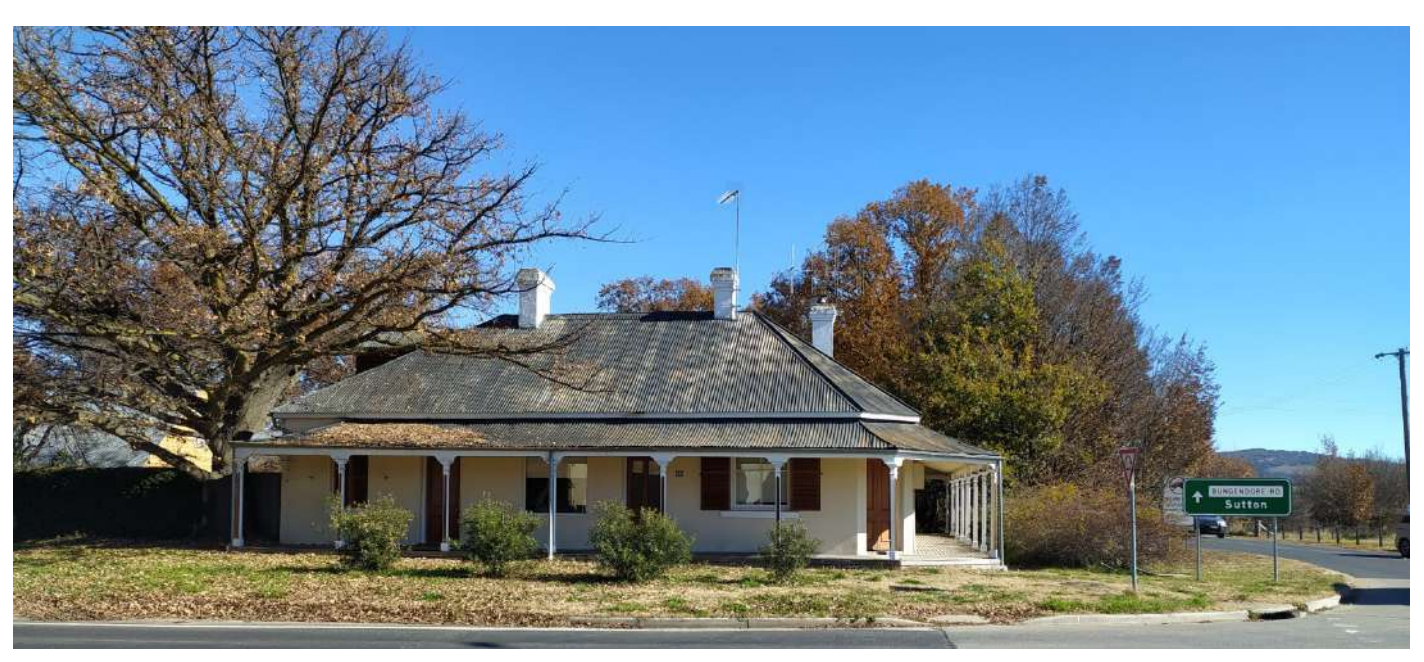
The Oriental Bank was built in the 1870s and featured in the 1969 Ned Kelly film with Mick Jagger