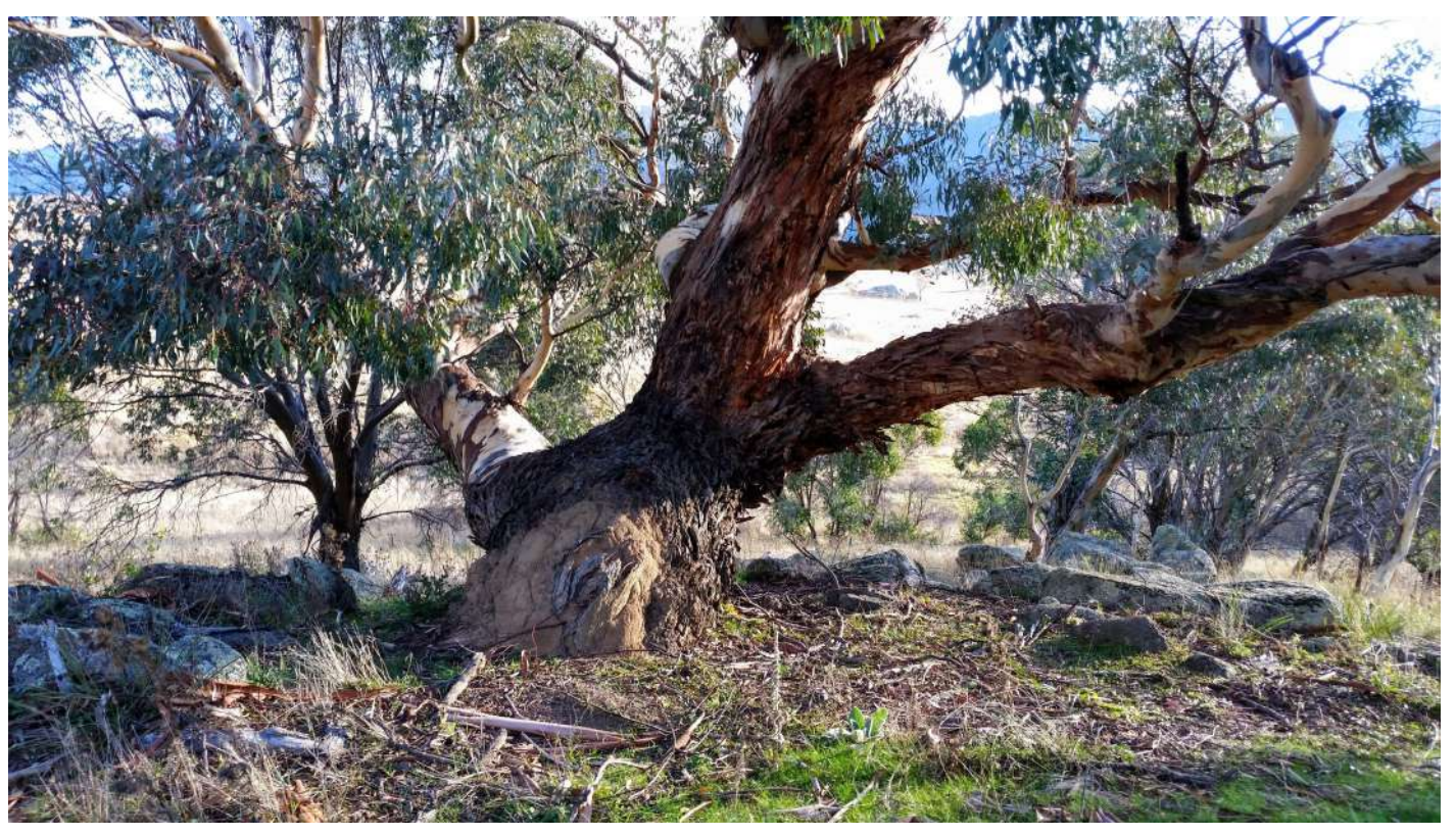
Magnificent old unburnt tree alongside Rendezvous Creek