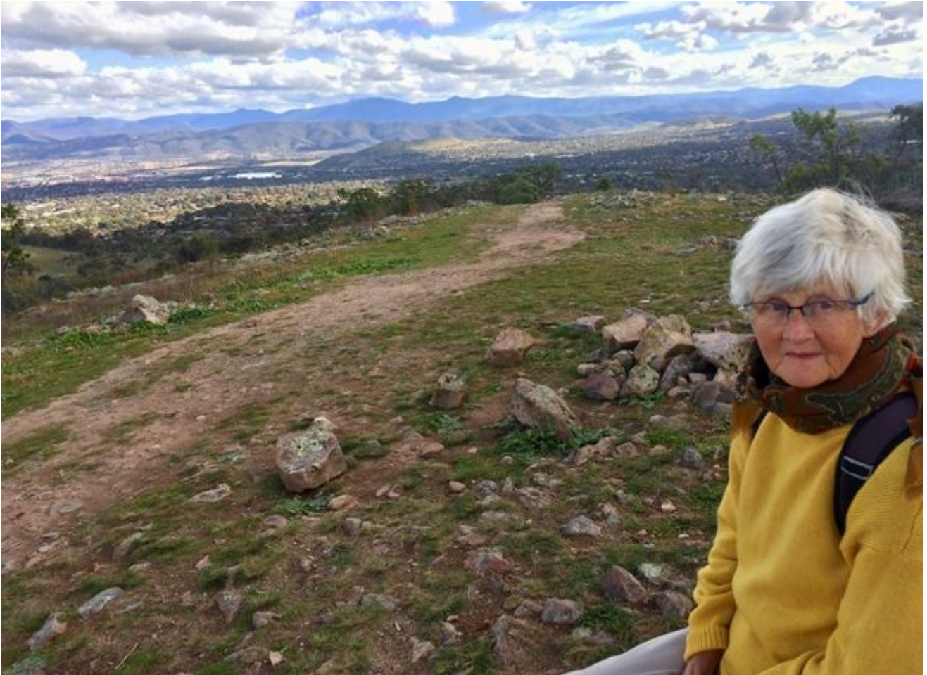
Enjoying the view from Wanniasa Hills