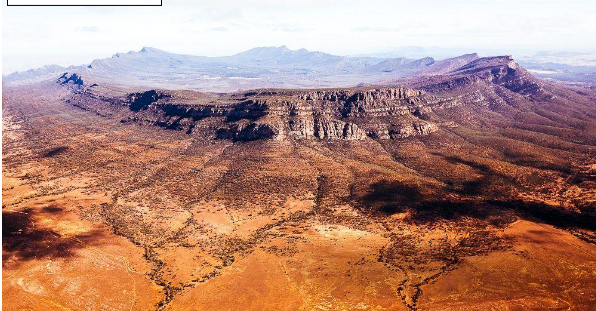
Wilpena Pound