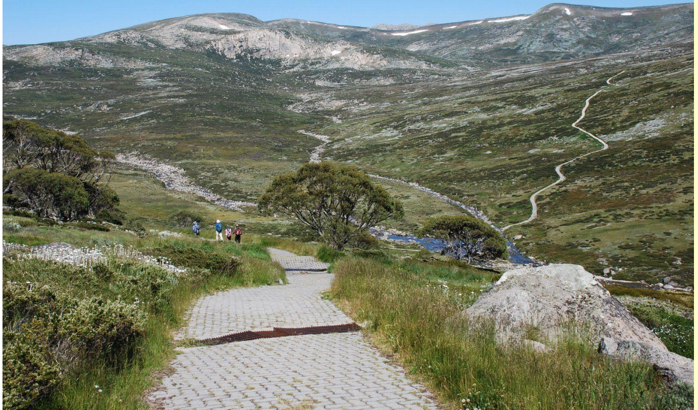
Perisher Valley