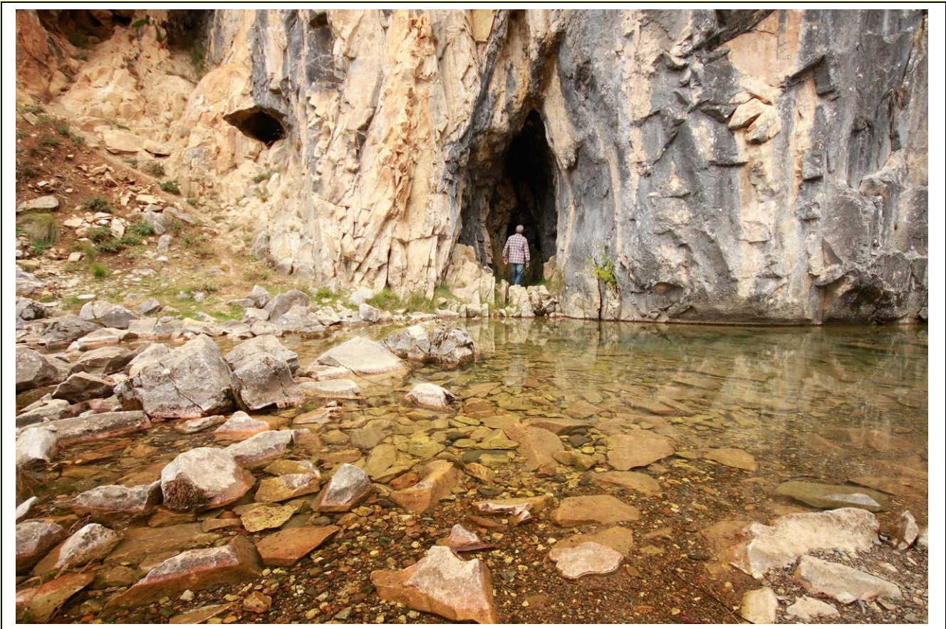
Blue Waterholes