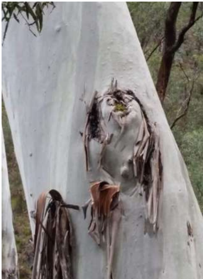
Not one of our 'new faces'