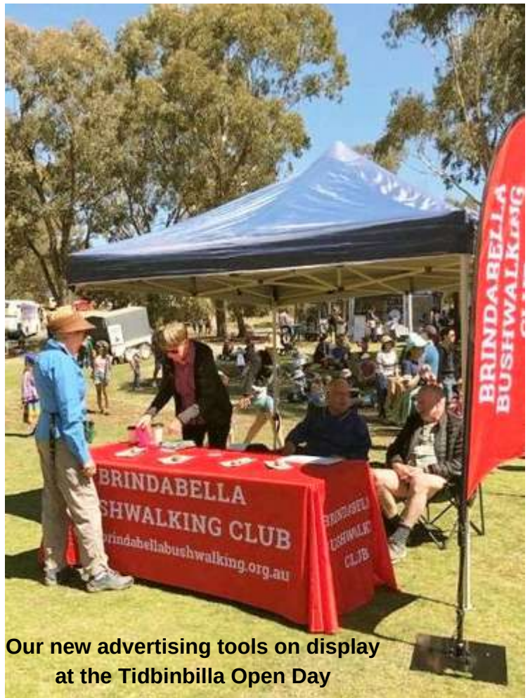
Our new advertising tools on display at the Tidbinbilla Open Day