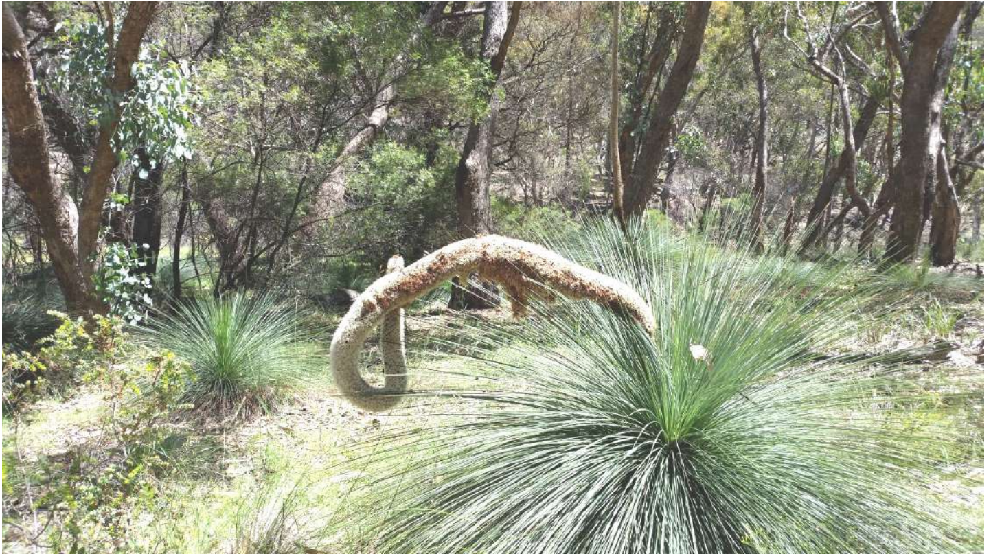
This grass tree at Mundoonen Nature Reserve has obviously had a battle