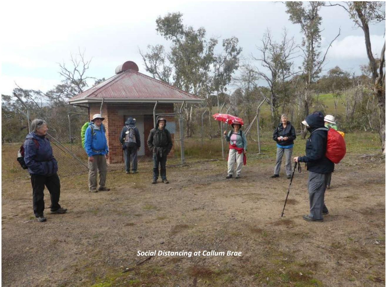
Social Distancing at Callum Brae