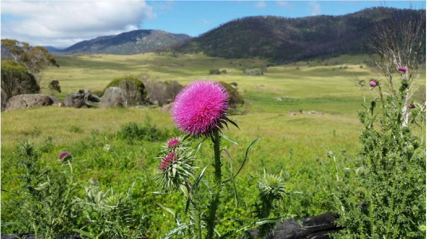
Even the thistles in Rendezvous Creek valley are looking beautiful now