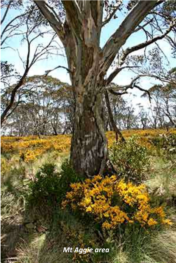
Mt Aggie area