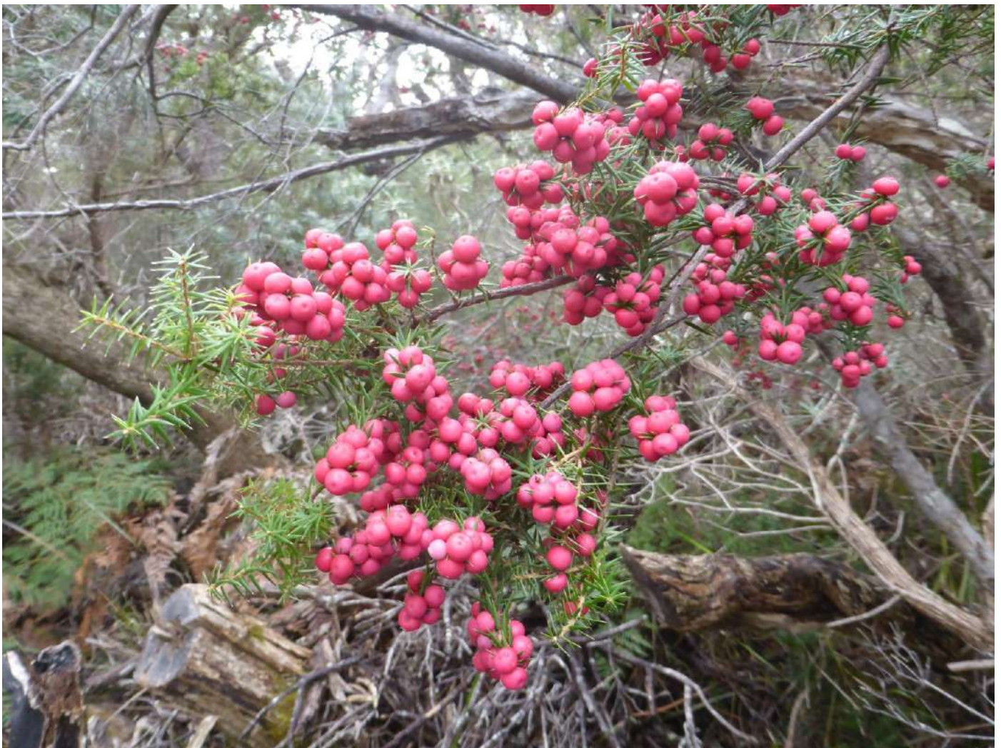
Pink Mountain Berry